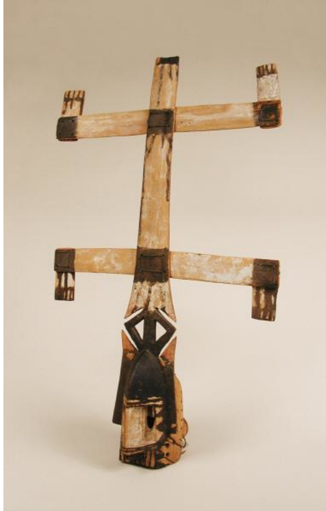
Image 8 Face mask (Kanaga) Dogon peoples, Mali Mid-late 20th century Wood, pigment National Museum of African Art, gift of Walt Disney World Co., a subsidiary of The Walt Disney Company 2005-6-533