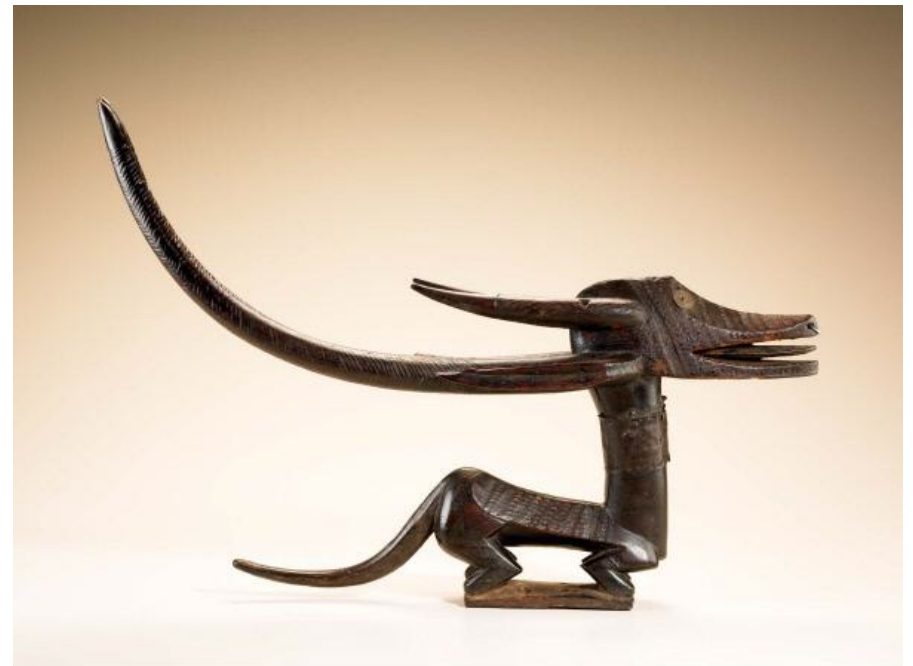
Image 11 Chi wara kun crest mask Bamana peoples, Mali 19 th -20th century Wood, metal National Museum of African Art, Smithsonian Institution, gift of Walt Disney World Co., a subsidiary of The Walt Disney Company, 2005-6-13