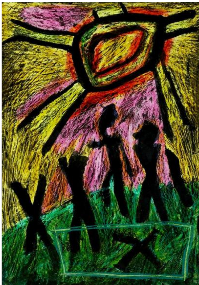
Image 7 Untitled , Garth Erasmus South Africa 1996 Acrylic and crayon on paper National Museum of African Art, Smithsonian Institution, purchased with funds provided by the Smithsonian Collections Acquisition Program, 96-23-1