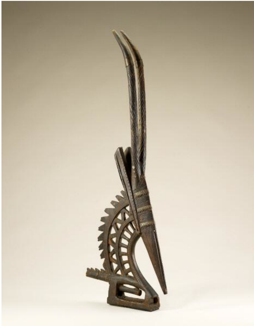
Image 10 Chi wara kun crest mask Bamana peoples, Mali Early 20th century Wood, metal National Museum of African Art, Smithsonian Institution, gift of Walt Disney World Co., a subsidiary of The Walt Disney Company, 2005-6-12